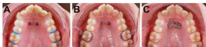
Figure 3. A, palatal miniscrews insertion; B, bands adapted on first molars; C, abutments placed over the screw heads (reprinted with permission from Perinetti et al. 14 ).