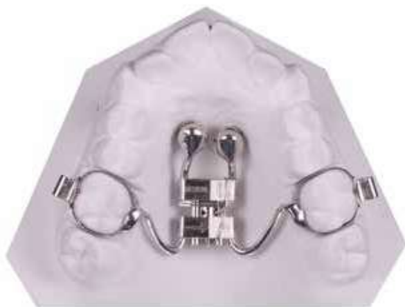
Figure 1. The MaXimo appliance (reprinted with permission from Perinetti et al. 14 )

The Leaf Expander® screw (Leone Orthodontics and Implantology, Sesto Fiorentino [FI], Italy) has been designed for slow and maxillary expansion. 12 However, its constant force release by a discontinued activation makes it a good candidate for a distalizing tool, where optimal force delivery for tooth movement has to be uninterrupted and constant. 13 This case report describes