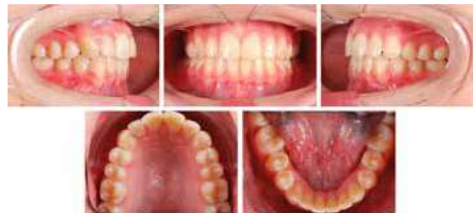
Figure 8. Patient after 12 months of follow-up when she was 15 years and 5 months old.

The timing of intervention for maxillary molar distalization in relation to the presence of second and third molars has been a matter of debate over the last few decades. 17-22 Before the advent of skeletal anchorage, a recommendation was to distalize before the eruption of the second molars, 19 even though recent evidence 18 has shown that the presence of erupted second molars (eventually along with unerupted third molars) would not have major effects on the degree of distalization (irrespective of the use of skeletal anchorage). Considering this piece of evidence 18 in combination with the use of skeletal anchorage, current