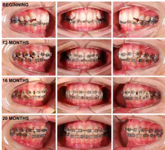
Figure 5. Frontal and lateral views of treatment progress from beginning to 20 months of treatment (modified with permission from Perinetti et al. 14 ).

skeletal transverse maxillary deficiency (Figure 2). A panoramic radiograph revealed the presence of all of the third molars and no other anomalies. At the moment the patient presented second molars were fully erupted (Figure 2). Orthodontic treatment was started immediately by means of a bilateral MaXimo appliance (900 g, code A2704-09, Leone Orthodontics and Implantology,) in combination with multibracket appliance. Written informed consent was obtained from the parents of the patient for publication of this case report and accompanying images.