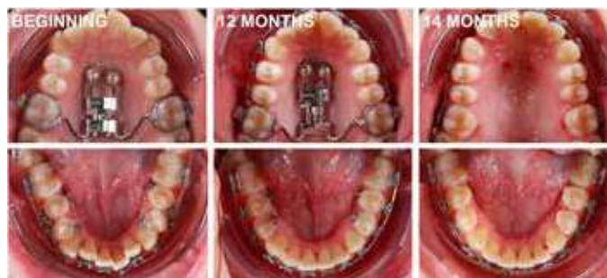
Figure 4. Maxillary occlusal views of treatment progress from beginning to 14 months of treatment when the MaXimo and miniscrews were removed (modified with permission from Perinetti et al. 14 ).