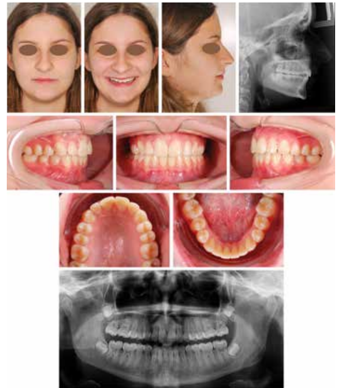
Figure 6. Patient after 25 months of treatment when she was 15 years and 5 months old.

the maxillary premolars and molars was evident although not complete, and bonding to the upper arch was executed (Figures 4, 5). At 14 months of treatment, the MaXimo appliance was removed along with the palatal miniscrews. Bands on the maxillary molars were replaced by bonded tubes and maxillary second molars were also bonded. During the active distalization phase, the MaXimo appliance was activated by 2-4 turns (0.2-0.4 mm) per month, and no breakage, pain or other undesired side effects was encountered. At 16 months of treatment, full-